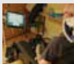
New technology for residents p3