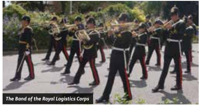
The Band of the Royal Logistics Corps