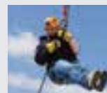
Heroes in our community p7