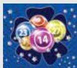
Play the QAHH Lottery p3