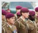
Remembrance Day at QAHH p3