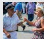
Open Day 2015 p7