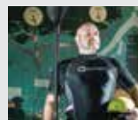
Find out about Project Youth Force p5