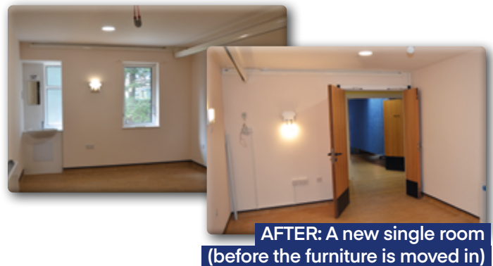
AFTER: A new single room (before the furniture is moved in)