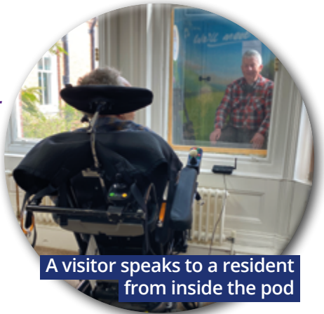
A visitor speaks to a resident from inside the pod