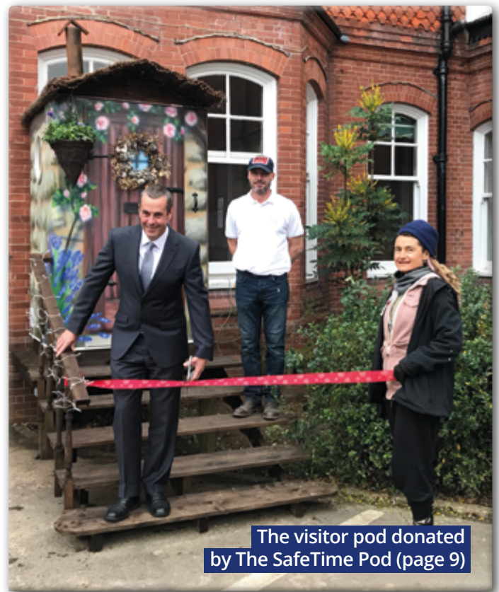
The visitor pod donated by The SafeTime Pod (page 9)

I am very proud of the way all of our clinical staff pulled together to ensure that our high standard of care continued during these difficult times. I also want to thank our residents and their loved ones for their help and patience in this long battle against Covid.