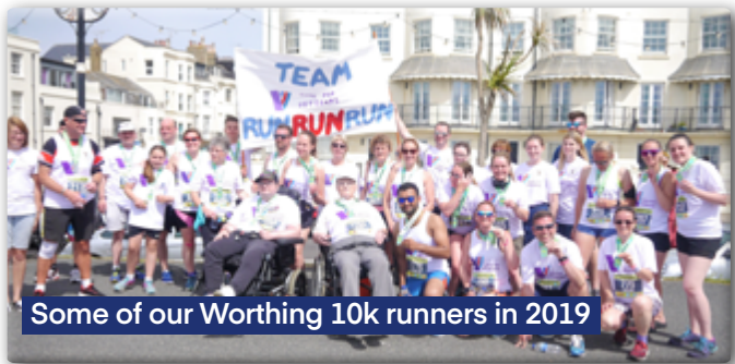
Some of our Worthing 10k runners in 2019

We also went to the Glitter Ball in 2018 - wow – what an event! It was an incredible night, and we are still friends with the people we met on our table.