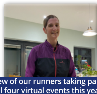
A few of our runners taking part in all four virtual events this year