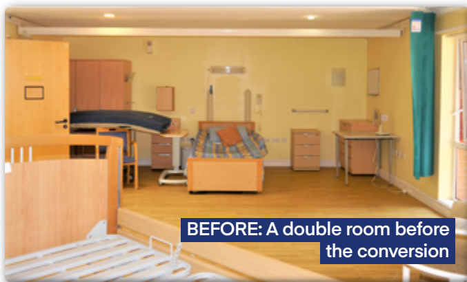
BEFORE: A double room before the conversion

One of the room conversions has been made possible by an award from Postcode Neighbourhood Trust, a grant-giving charity funded entirely by players of People's Postcode Lottery. We are extremely grateful for such a generous grant award – especially at such a challenging time.