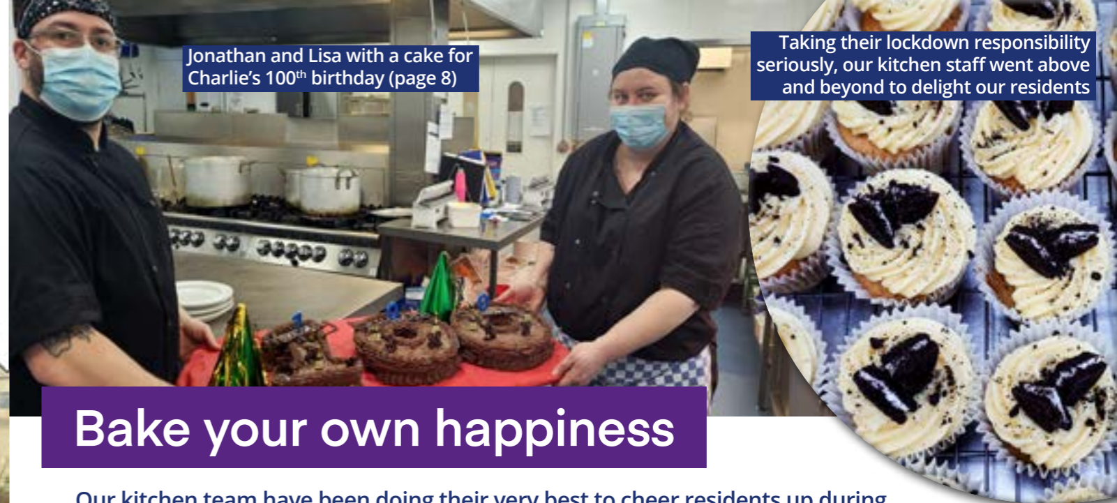
Taking their lockdown responsibility seriously, our kitchen staff went above and beyond to delight our residents