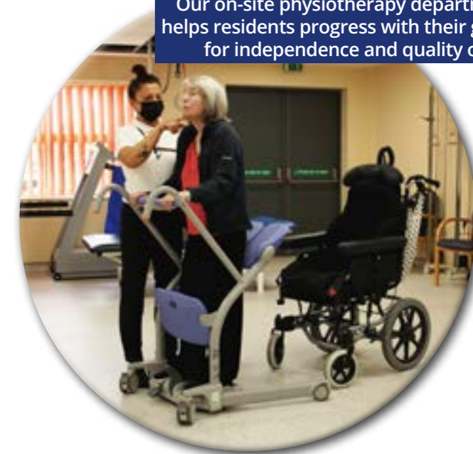
Our on-site physiotherapy department helps residents progress with their goals for independence and quality of life

To set up a regular gift, please complete the enclosed form or scan the QR code to visit our website